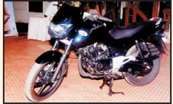
Bumper Prize: Bajaj Purser 150 CC Bike