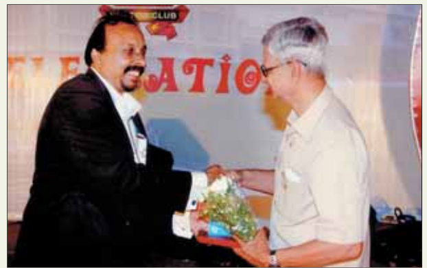
Editor recognised in the Celebrations