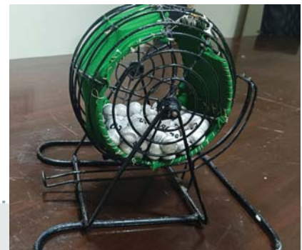
Using since 40 years to pickup numbers

So, next time the cage begins to spin and the numbers are called, join us in this beloved tradition. Who knows? The next shout of "Full House!" could be yours.