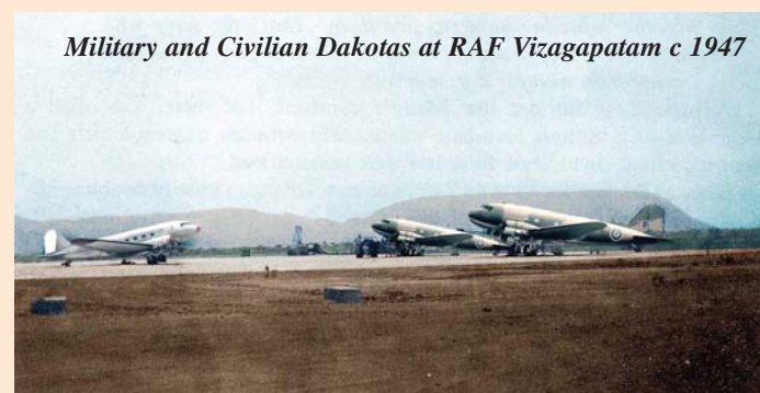
Military and Civilian Dakotas at RAF Vizagapatam c 1947

The Waltair Club propeller owes its history to the Dakota aircraft of RAF Vizagapatam and the inspiring soldiers of the