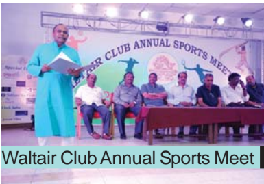
Waltair Club Annual Sports Meet