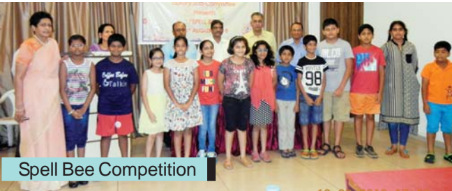
Spell Bee Competition