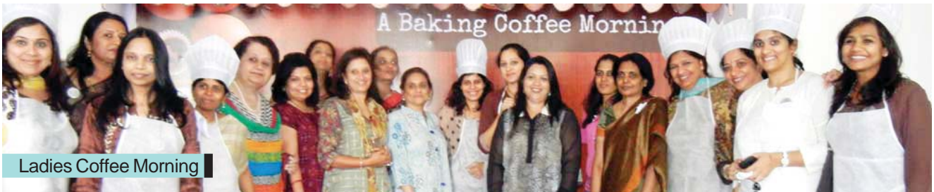
Ladies Coffee Morning