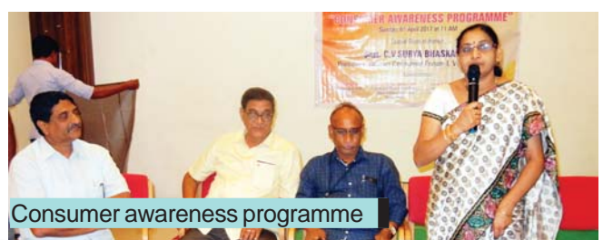
Consumer awareness programme