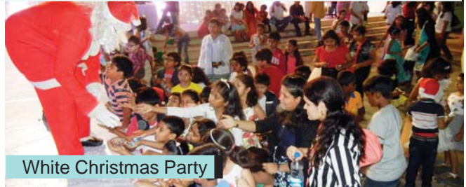
White Christmas Party