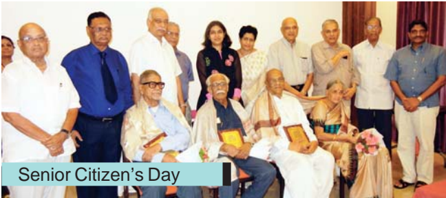
Senior Citizen's Day