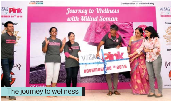
The journey to wellness