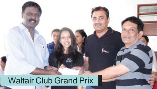
Waltair Club Grand Prix