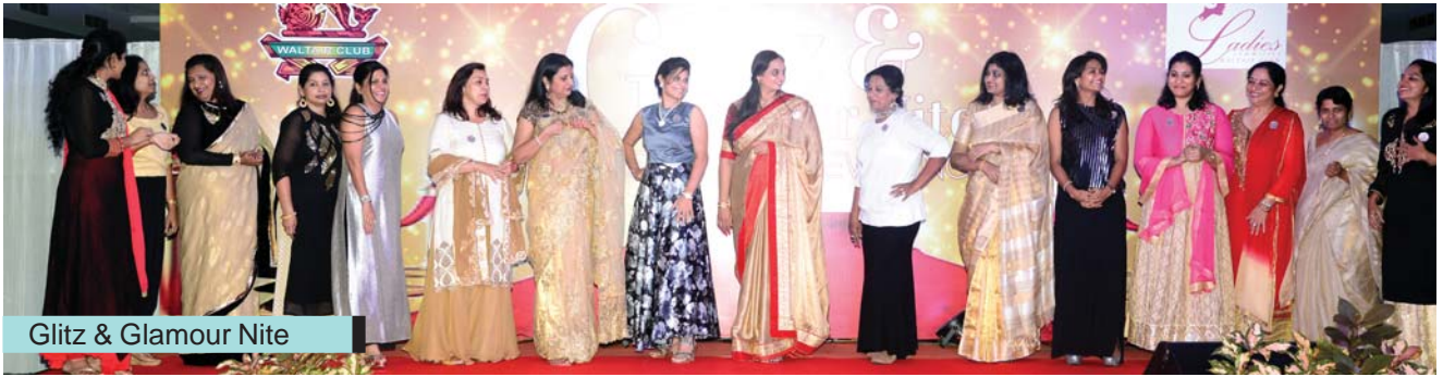
Glitz & Glamour Nite