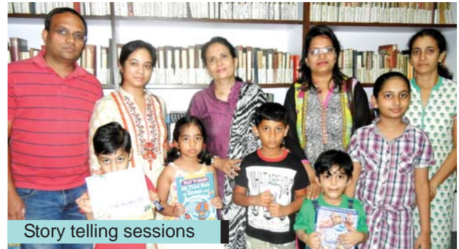
Story telling sessions