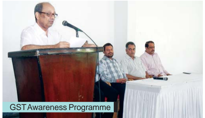
GST Awareness Programme