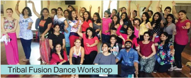
Tribal Fusion Dance Workshop