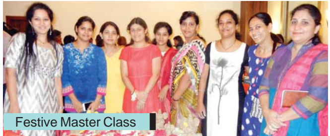
Festive Master Class